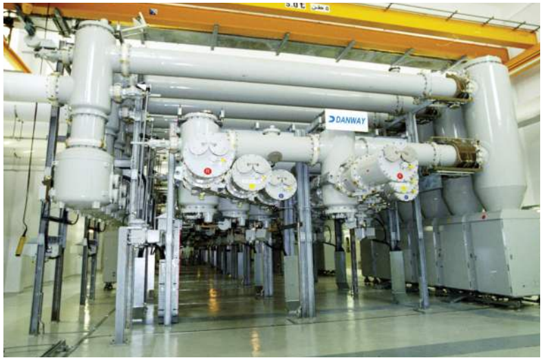
DEWA 400kV Substation