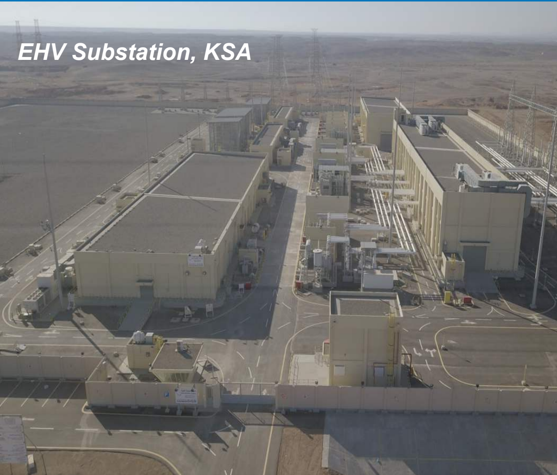
EHV Substation, KSA