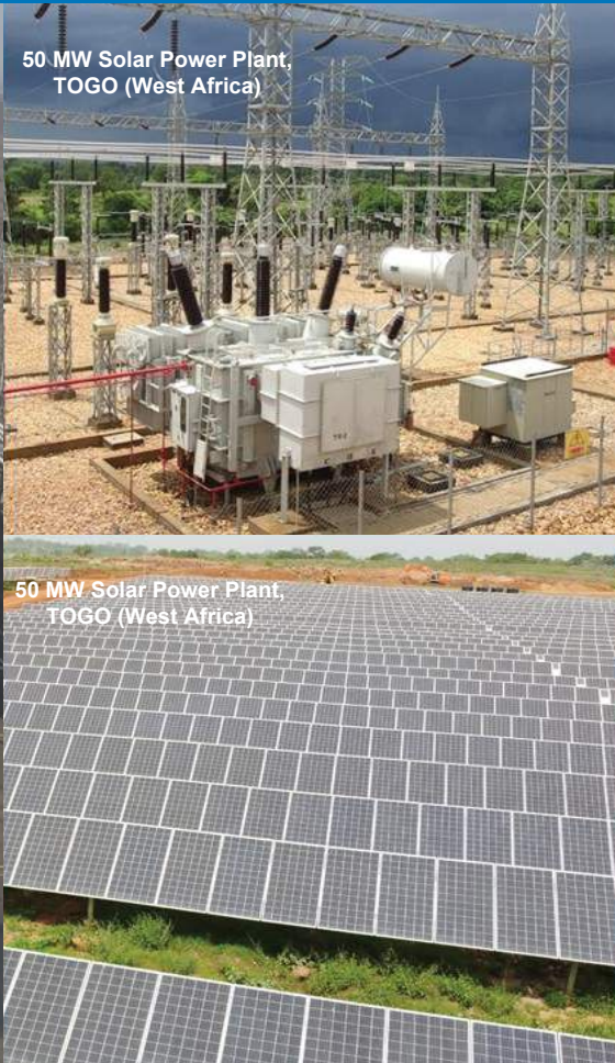
50 MW Solar Power Plant, TOGO (West Africa)