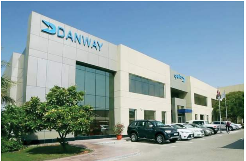
DANWAY Head Office – DIP II, Dubai, UAE