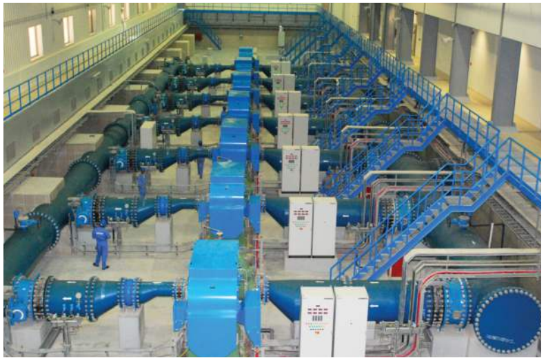
Taweelah Unit III - UAN Water Transmission Scheme